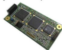
Plug-in to the AR5001D Approx. size 100 x 50mm

APCO P-25 Digital Voice Decoder option is available for the demodulation of project 25 (P25) digital voice communication which are popular in North American for the government and public safety communications.