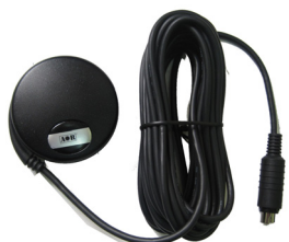
Optional GPS Receiver – Third party product. (Connect to accessory jack.)

The AR5001D is capable of using GPS pulse signal for an accurate time base for the local oscillator circuit. 0.01ppm frequency accuracy for the 10MHz internal master oscillator is obtained when synchronized to a GPS signal.